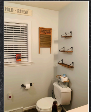
New shelves for Nicole to decorate with