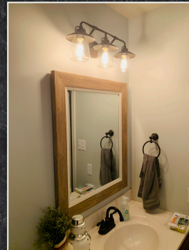
New light fixtures, mirrors, and hand towel holders