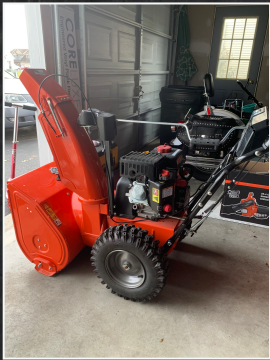
My new toy!

Not only has our home undergone a transformation, the lives of those that were touched by God this past month had as well. In fact, January was an incredible month filled with some amazing testimonies. I'm excited for you to read on and discover all the amazing things that took place through Faith Like Birds this first month in 2021.